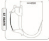
CHOICE OF TINES

www.rovicleers.co.za Leading Farming Technology