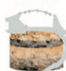
Super 25 Deep Ripper