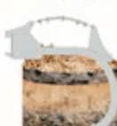
Super 32 Deep Ripper